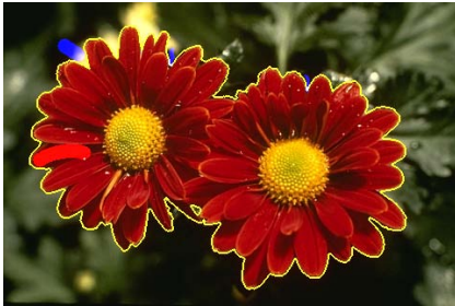
user interactivity (4 additional strokes)