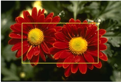
initialization (2 clicks)