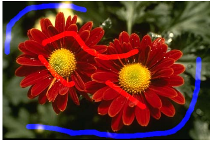
initialization (5 strokes)