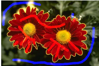
user interactivity (9 additional strokes)