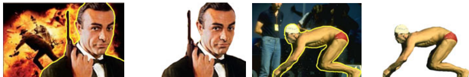
Fig. 1. Segmentation results using the proposed user-interactive segmentation framework. The left example is a James Bond photo from the internet and the right one is from the Berkeley Segmentation Database.

A simple rule-based reasoning is usually used to integrate user interaction into the segmentation process: if the user marks a pixel as an object, then it is forced to be object, on the contrary a pixel is background if the user marks it as background. These so-called hard constraints can also be found in [1,16,4]