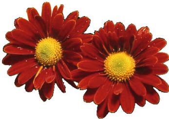
Final segmentation result after user refinement (Initialization (2 clicks, 1 foreground and 3 background strokes)